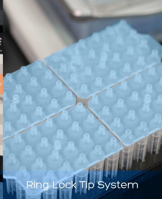
Ring Lock Tip System