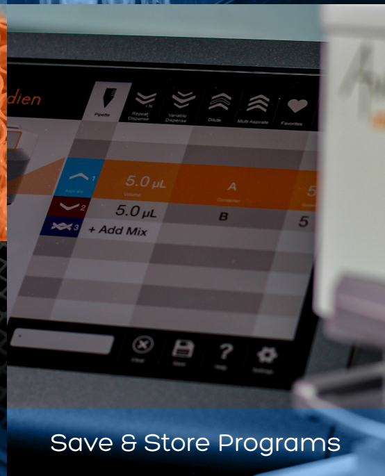
Save & Store Programs