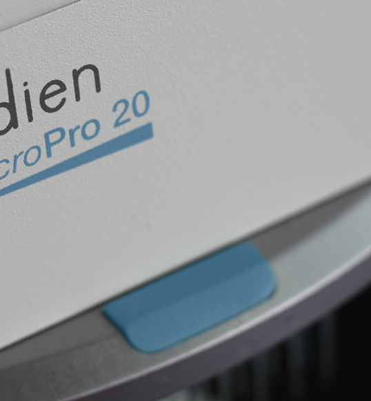
One Button Simplicity