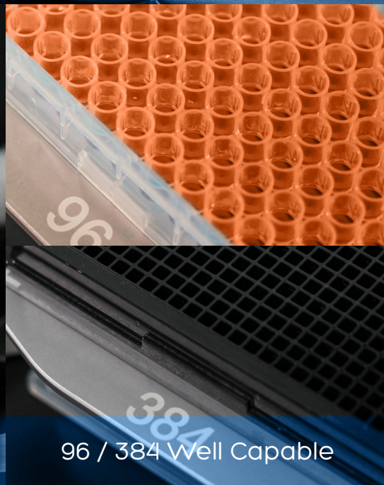
96 / 384 Well Capable